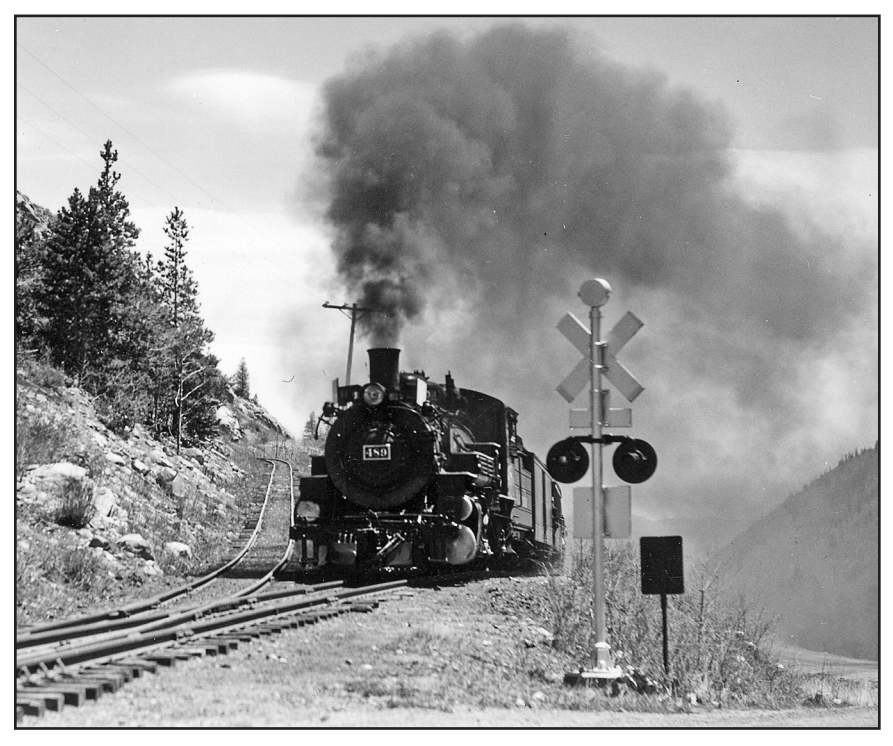
D&RGW 489 with a Rocky Mountain Railroad Club excursion at the lower 4.5% switchback at Garfield, Colorado on the Monarch Branch above Maysville, Colorado with six cars on May 21, 1950.

494. Passengers spent the night in Gunnison and on the 19th engine 361 took them from Gunnison to Cimarron and upon the return it developed a mechanical problem, so engine 360 was fired up and they reached Gunnison at dusk. The return to Salida (engine 494 with helper 498 from Sargent to the top of Marshall Pass) was made after dark. As it turned out it was one of the more memorable trips operated. On every curve whenever the fireman opened the firebox door to shovel in coal, it lit up the countryside and the fall colors were visible on the mountainsides, making for spectacular and unusual scenes. On May 30, 1949