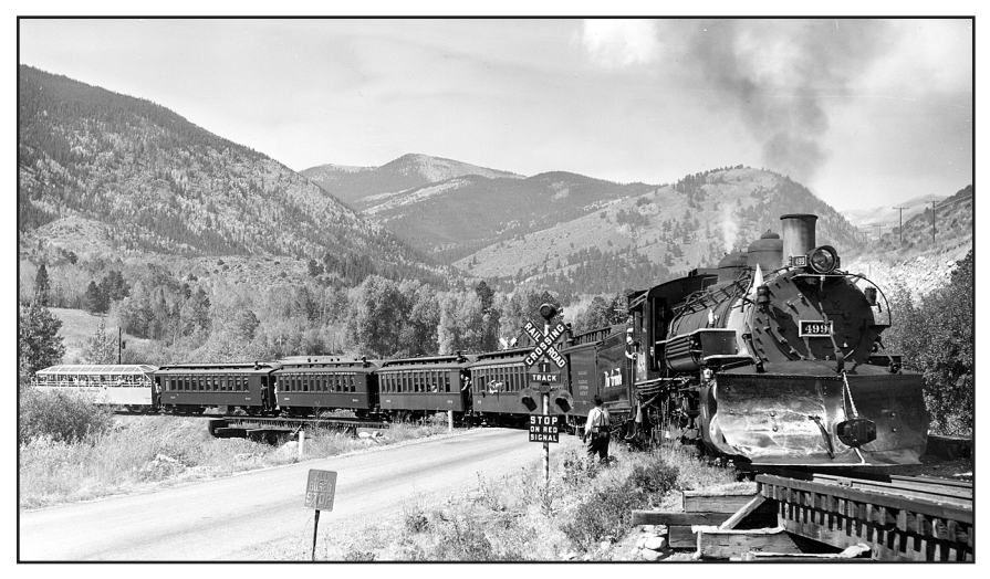
D&RGW 499 with an excursion train on a sharp curve above Maysville, Colorado with six cars on the Monarch Branch on September 25, 1949.

risen, perhaps our members will find local events more appealing and within their budgets. Here are a few thoughts and ideas: