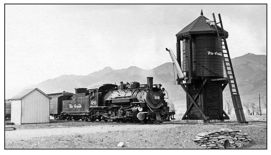
D&RGW 489 arriving at Villa Grove, Colorado with a Rocky Mountain Railroad Club Special on May 21, 1950.

The Cimarron portion through the Black Canyon (D&RGs original main line) was abandoned in 1949. The Poncha Pass line (through Villa Grove) was the narrow gauge main line connection to Alamosa and it was closed in 1951. The Marshall Pass line was abandoned in 1954 (due to closure of CF&I coal mines at Crested Butte) and the track was removed in 1955. The Monarch Branch served the CF&I limestone quarry at Monarch and it was standard gauged in 1956.